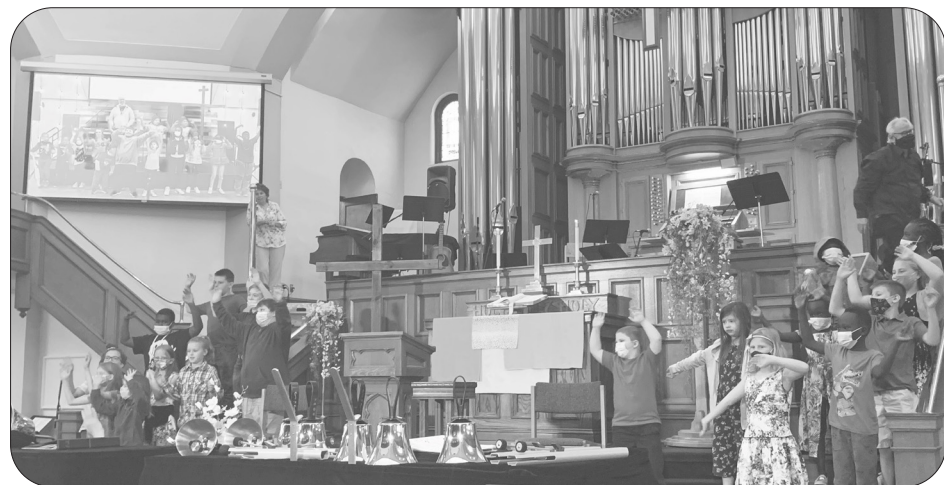
We were able to bring Wednesday night Ignite and Sunday morning Kid's Connection kids together for the sending song, Light of the World , in Worship. Looking forward to the fall!