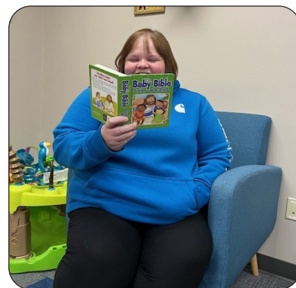
We are ready to meet and grow with you and your toddler!

Please contact me if you are interested in being a part of the First Steps class or if you know someone who you think may appreciate hearing more about the class. I will make it a point to talk to anyone as I can't wait to see families with young children come together in community.