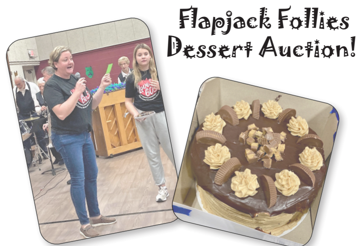
Flapjack Follies Dessert Auction!