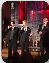
Tonic Sol Fa 2016

Proceeds will go to support the 2017-2018 Live @ First Concert Series. Get your ticket at the Information Center.