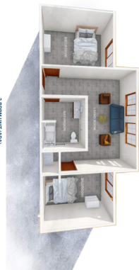
TYPICAL UNIT LAYOUT

Our April Love the 605 is the Bishop Dudley Center for Families . This is a new ministry starting soon in Sioux Falls that will help families stay together at the Bishop Dudley. Located at the former Children's Inn building on Western Avenue, the Center will have 10 total family units. Thanks for helping those in our community!"